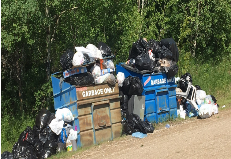
Our landfill attendant removed the accepted items which left still a pile of garbage :

We all want to be respected, no matter what job we have. One might think their job is more important than another job...this is simply not the case...everyone’s job is important and needs to be treated as such. We have landfill attendants that take their job seriously. They want to make sure the rules are followed for not only their own safety but to make sure our municipality looks its best. Pictured below are the garbage bins at Thomas Lake. The bins and the ground is overflowing with unacceptable materials: