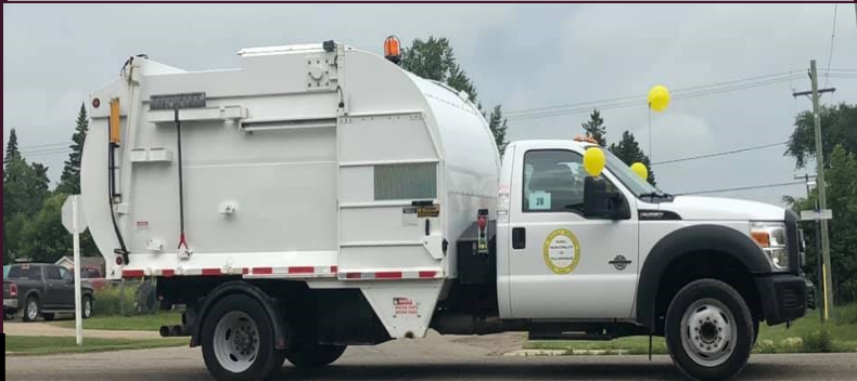
The R.M. of Yellowhead garbage truck in the Shoal Lake Ag. Society Parade on July 17th, 2019

Understand Your Water Rates With the utility rate changes effective July 1st, the most commonly asked question is “why are the Strathclair rates higher than the Shoal Lake rates?” Here is the answer: The cost to operate the utility is divided among users. Each utility is its own entity. The municipality hired a consultant to compile a study to determine the rates of each of our utilities. This study was then sent to the Public Utilities Board (PUB) for approval. The PUB then forwards an order to the municipality setting the rates for each utility.